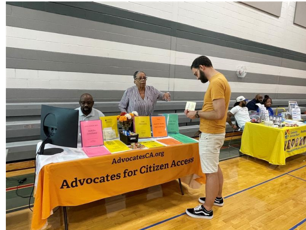
Health Fair Fairfax County Health Dept and Tinner Hill Heritage Foundation September 16, 2023